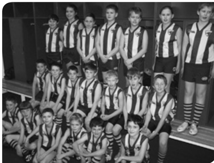
ABOVE: Mid SE players ready to take part in a Little League match against the Mallee District at Adelaide Oval last Friday.

Thanks to all our valued sponsors for Season 2014!