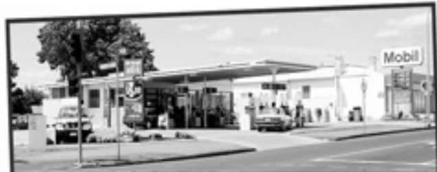
Crouch Street 24 Hour Service Station 115 Commercial St East, Mt Gambier • 8725 4200