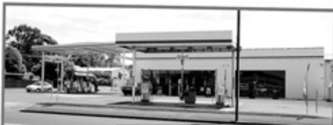
Shell Bay Road Service Station 32 Bay Road, Mt Gambier • 8725 2595