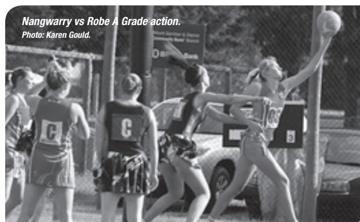
Nangwarry vs Robe A Grade action.

A Reserve: Whoo hoo, great win girls. Good to be behind all game but come across for the win. Awesome fighting spirit. What can I say? We were a different team (and