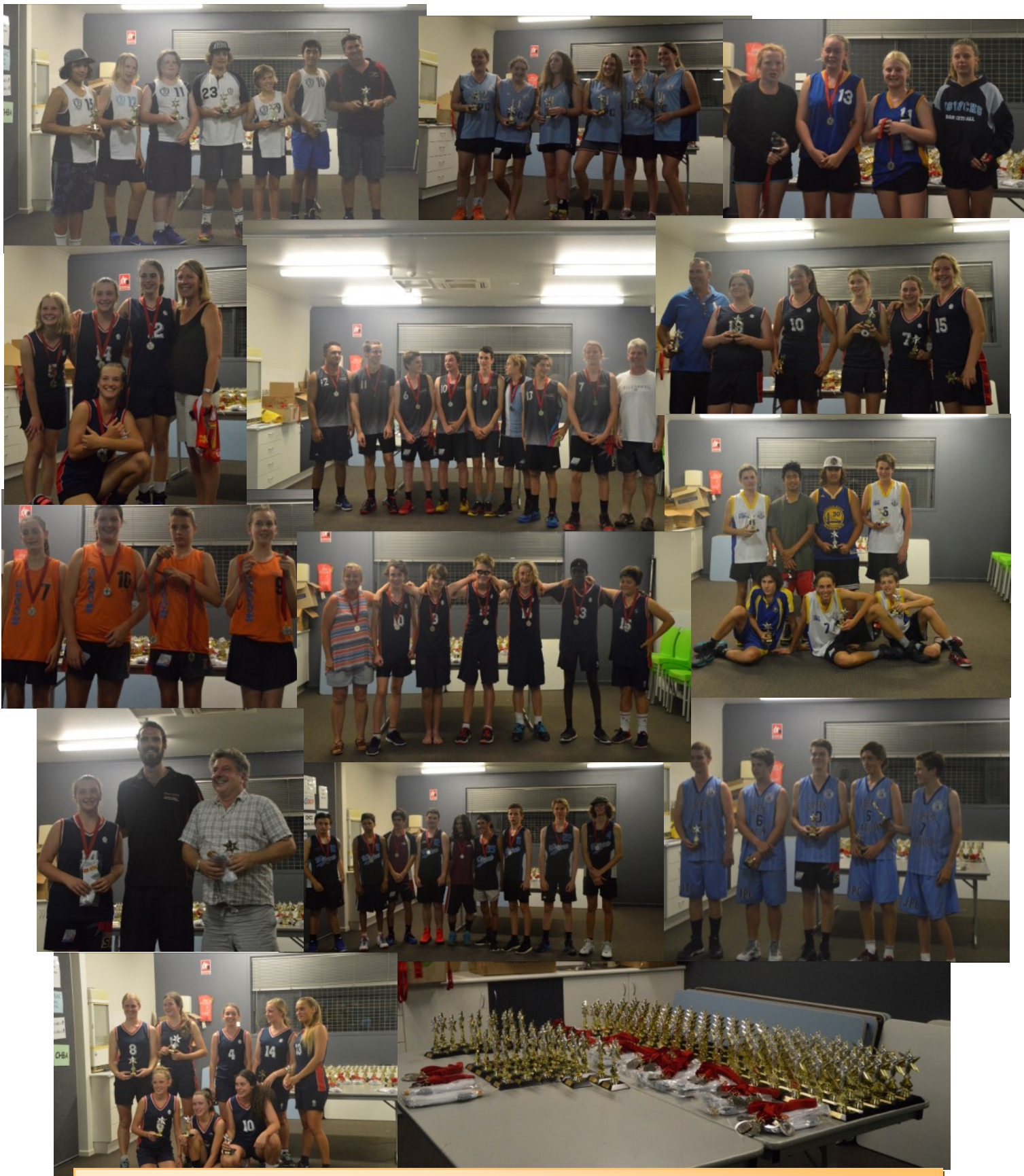
GRAND FINAL DAY—HIGH SCHOOL COMP