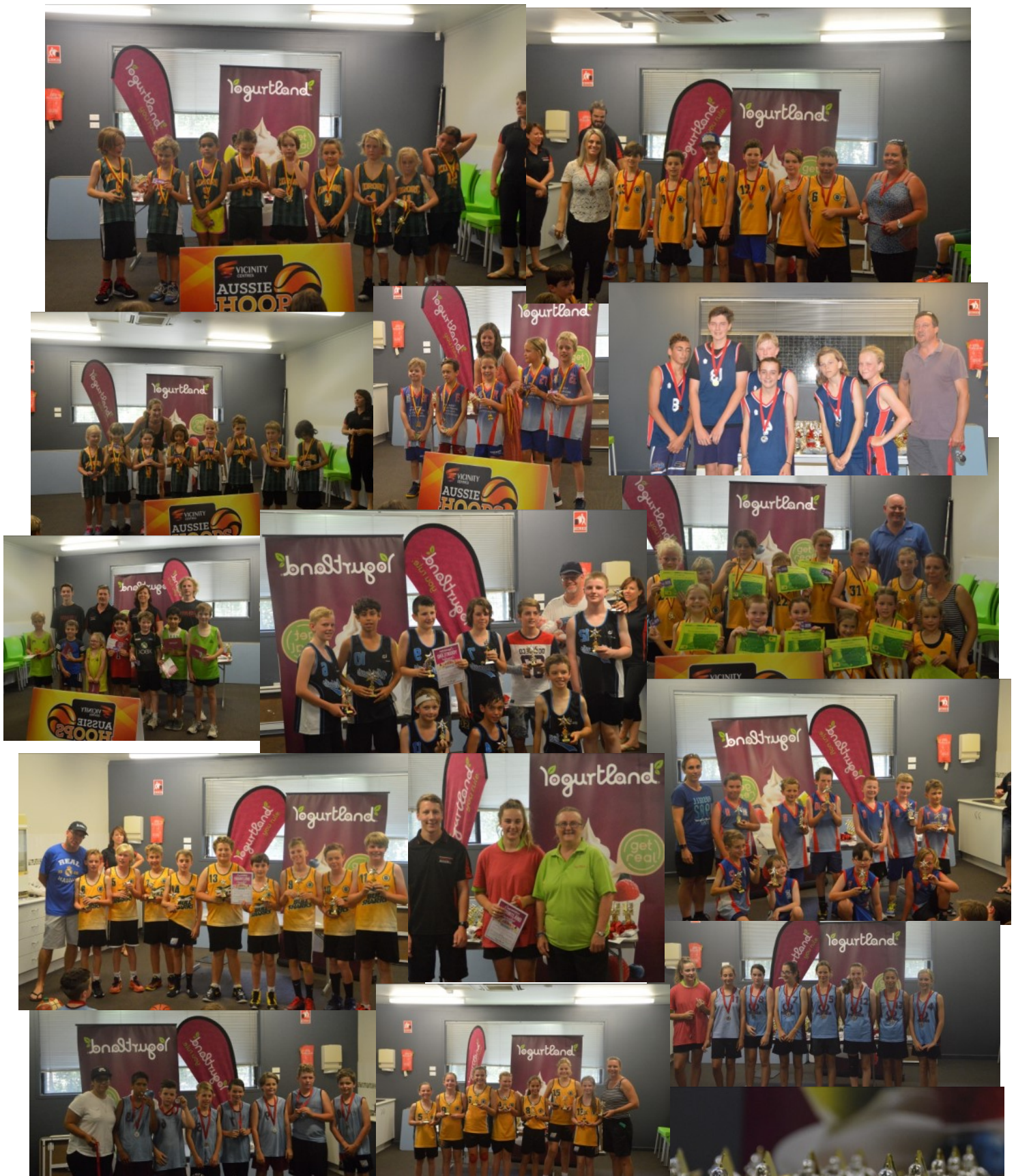
GRAND FINAL DAY PRIMARY SCHOOL COMP