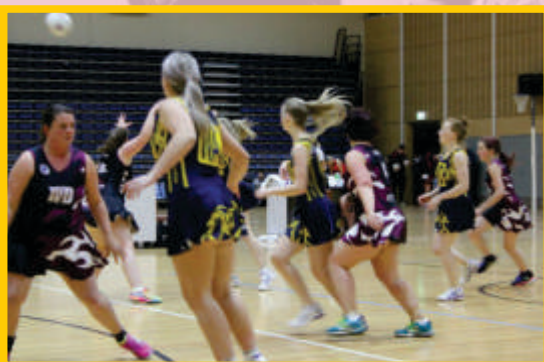
Photo of sponsored player displayed in clubrooms with your company name

This will include 1 ticket to our ladies day luncheon