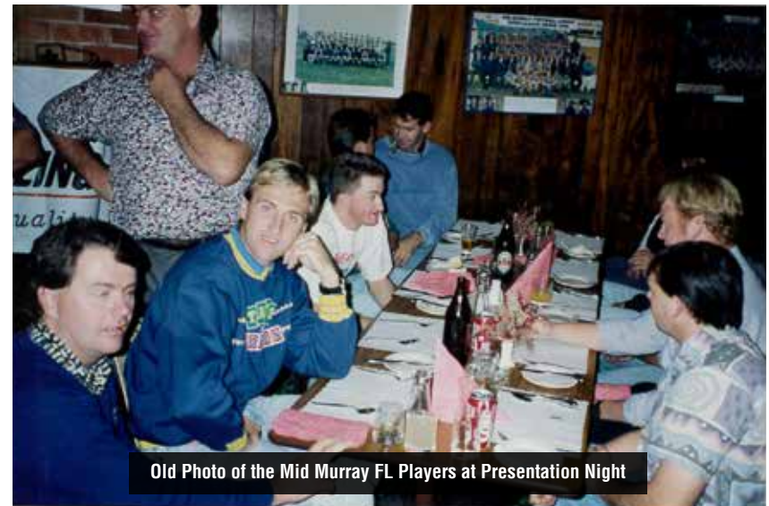
Old Photo of the Mid Murray FL Players at Presentation Night