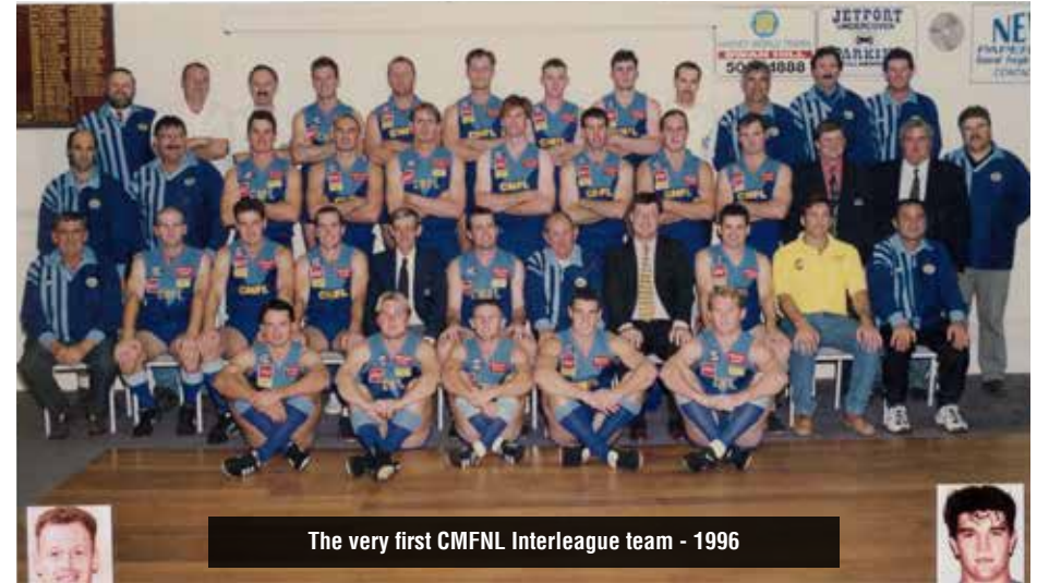
The very first CMFNL Interleague team - 1996