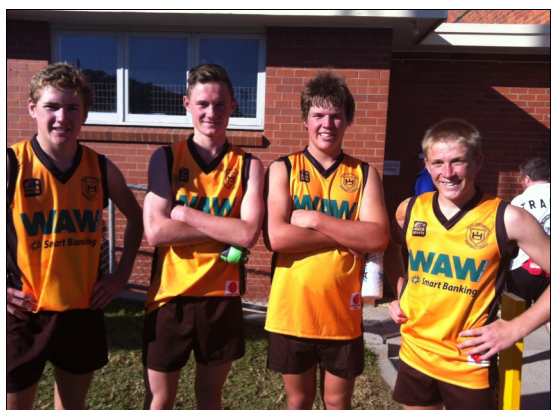
Above: Under 17 Interleague Reps