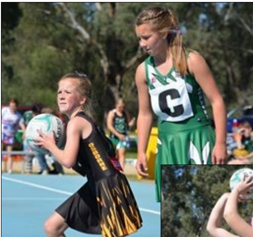
Junior netballers after defeating Walla in the Elimination Final