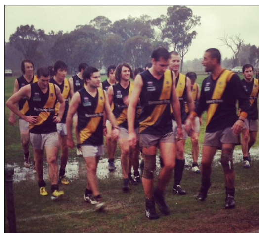
Above: Who could forget the wet weather at Walla?!