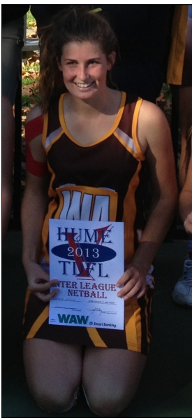
Clockwise from top:

“Expect the Unexpected” C Reserve slogan!