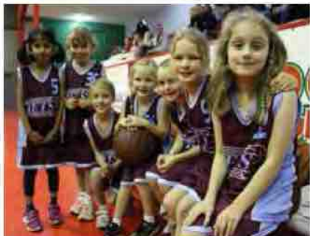
U08 GIRLS ELTHAM NORTH