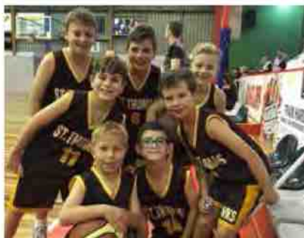
U10 BOYS ST THOMAS 1