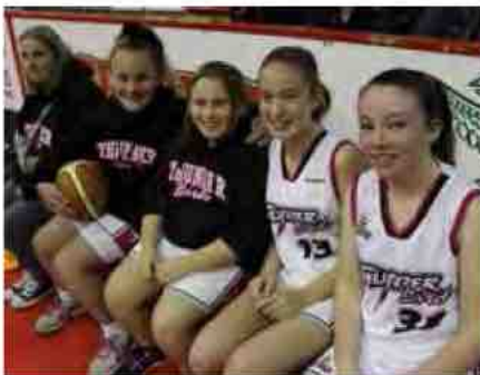
U14 GIRLS LAURIMAR THUNDER 1