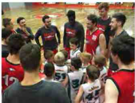
U12 BOYS LAURIMAR THUNDER 5