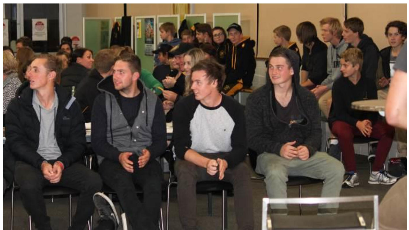
Junior players, senior players and families enjoying a night together.