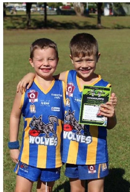
Round 5 – Captain: Jye / POTW: Jhett