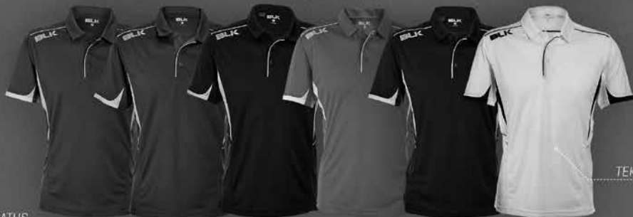
TEK V POLO