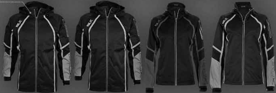
TEK STRATUS V JACKET