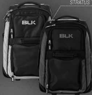
STRATUS TRAVEL BAG