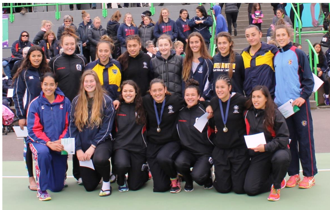
2015 Lower North Island Secondary Schools Netball Tournament Selection – Grade A

21 st Place – Onslow College 25 th Place – Wellington High School