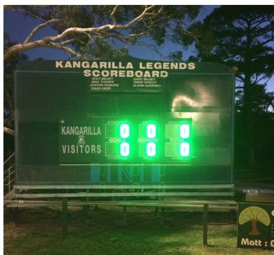
New Scoreboard at Kangarilla