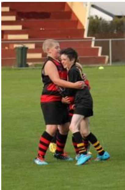
....the blue boots brigade