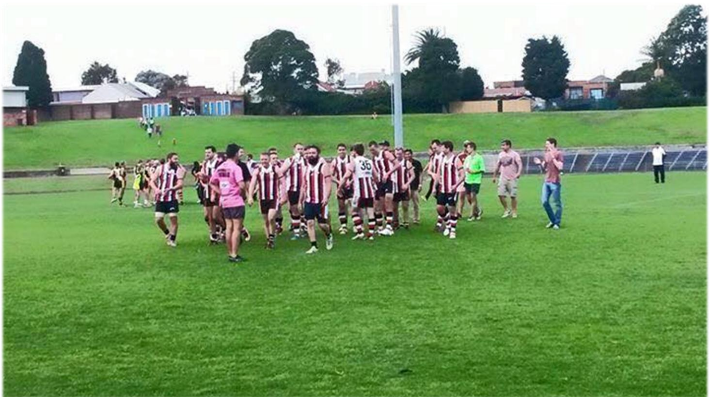
Above: 1 Saints Division Five team take in the winning feeling at the end of a hard-fought contest against Balmain on Sunday morning.

The Saints had a weekend of mixed results, seeing their senior team go down against a physical Penrith side at home on Saturday.