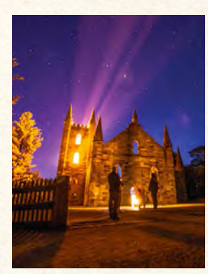
Port Arthur Historic Site

sea and enjoy a close encounter with wild and spectacular coastal landscapes, waterfalls, deep sea caves and amazing animal and sea life. View the highest sea cliffs in the Southern Hemisphere and towering sea stacks of Cathedral Rock, the Totem Pole and Candlestick while cruising in and out of sea caves. Look out for seals,