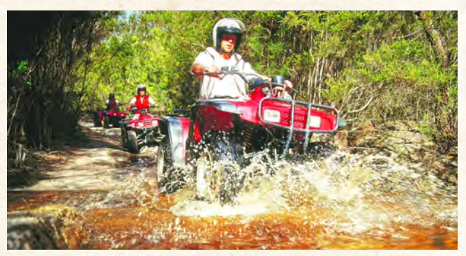
All 4 Adventures