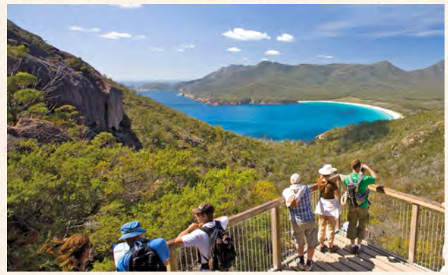
Wineglass Bay Lookout