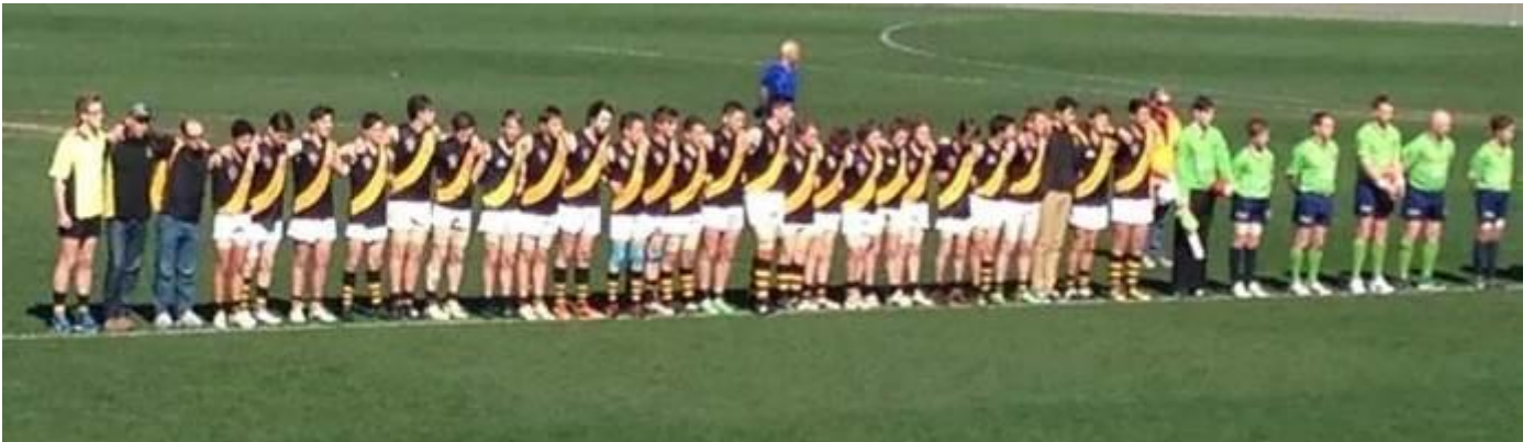
Under 16 players line up before their match