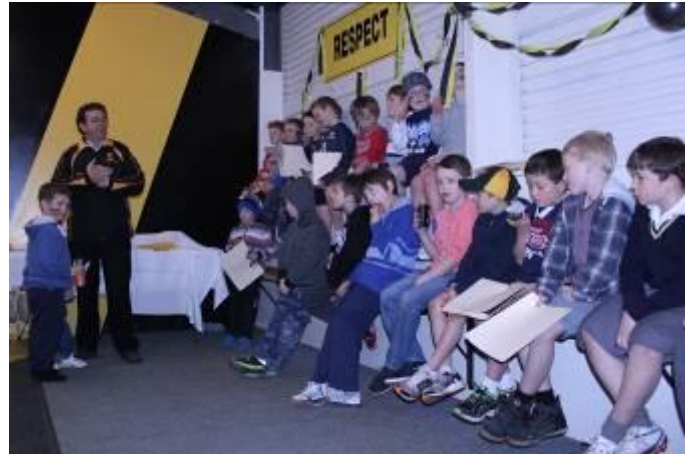
Trophy presentations took place in the change rooms