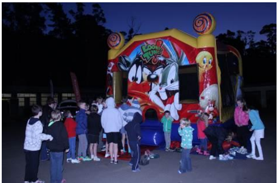
We loved the Powerade Handball trailer and the jumping castle