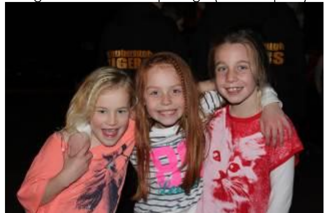
Sausages, chips and cans of fizzy kept the kids happy while lining up for a turn in the jumping castle