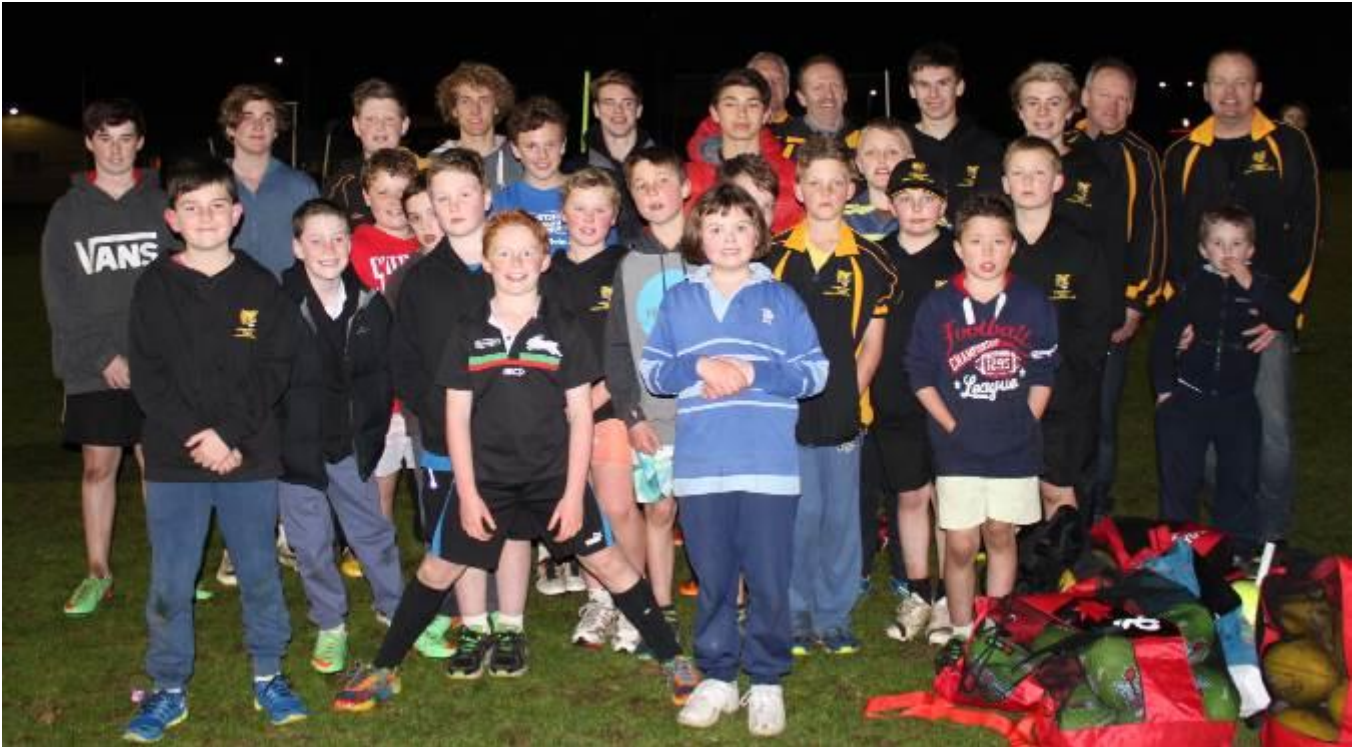
Longest kick finalists from Auskick to under 16 waiting to kick off for the prestige (and the prize)