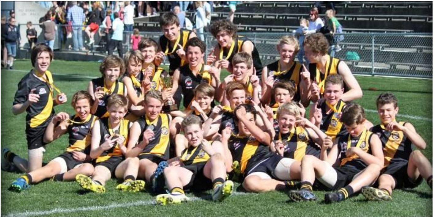
Under 14 Gold celebrate their premiership