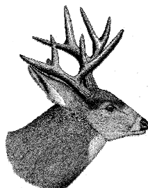
White Hart Hotel