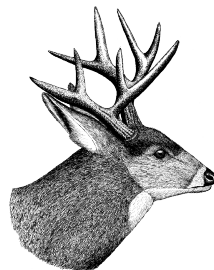
White Hart Hotel