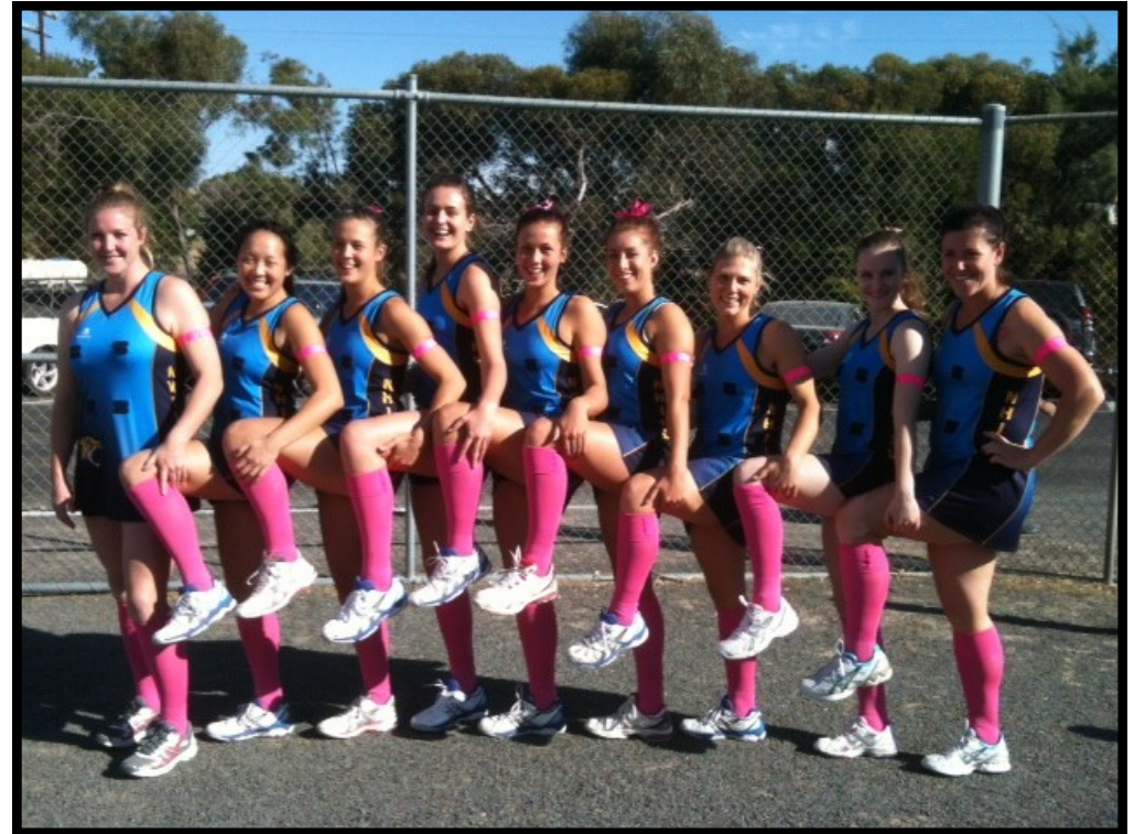
The girls showing their support for Pink Day.