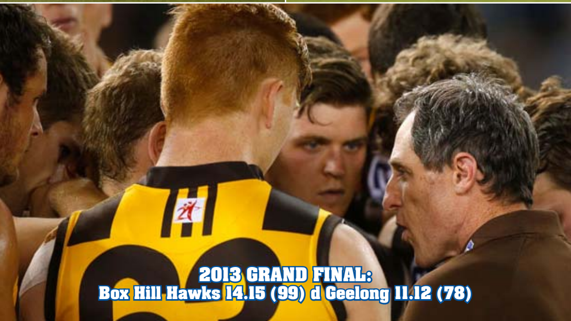
2013 GRAND FINAL: Box Hill Hawks 14.15 (99) d Geelong 11.12 (78)