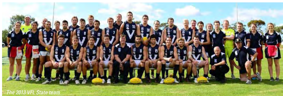
The 2013 VFL State team

GW: Over the course of the past few months there has been regular consultation with all VFL and AFL Clubs involved about the structure of the competition into the