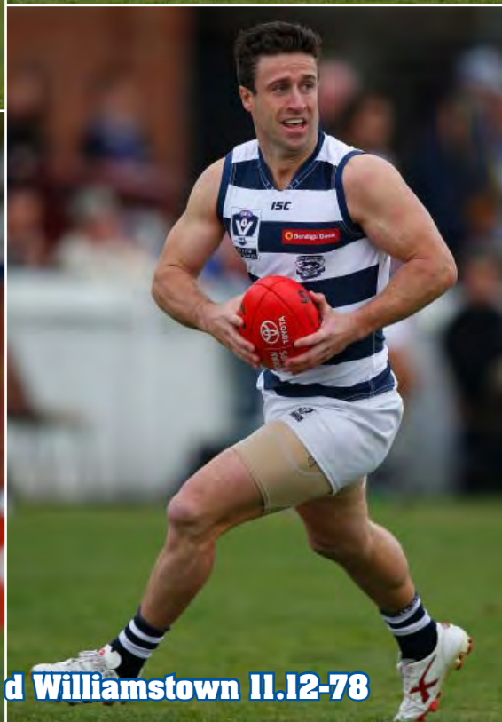
Geelong Cats 24.16-160 d Williamstown 11.12-78