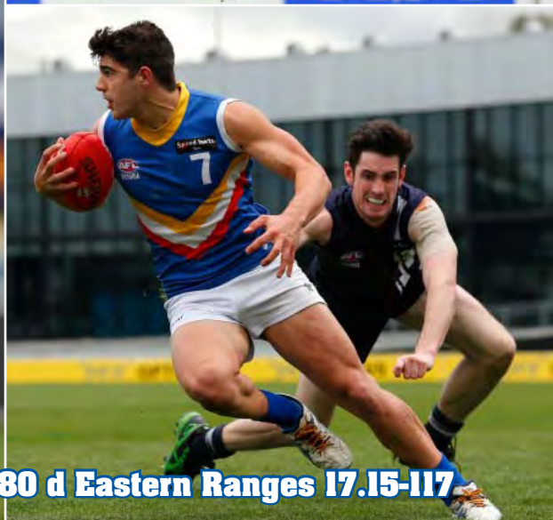
Geelong Falcons 11.14-80 d Eastern Ranges 17.15-117