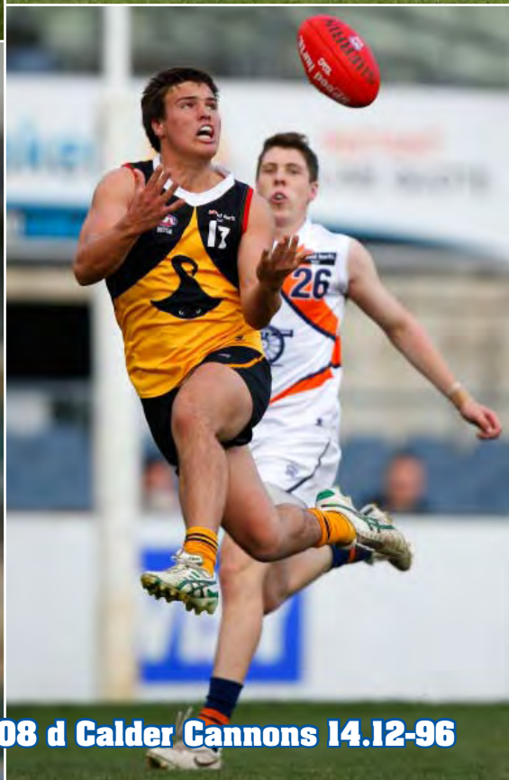
Dandenong Stingrays 16.12-108 d Calder Cannons 14.12-96