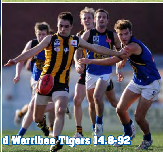
Box Hill Hawks 22.12-144 d Werribee Tigers 14.8-92