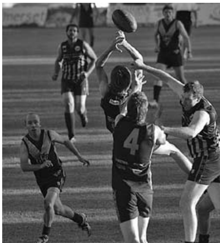
Mount Burr vs Glencoe A Grade.