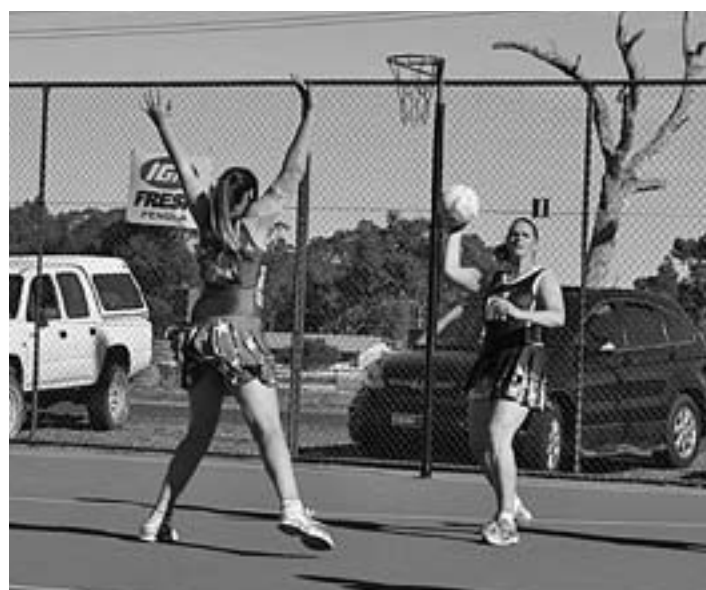
Kalangadoo v Hatherleigh.