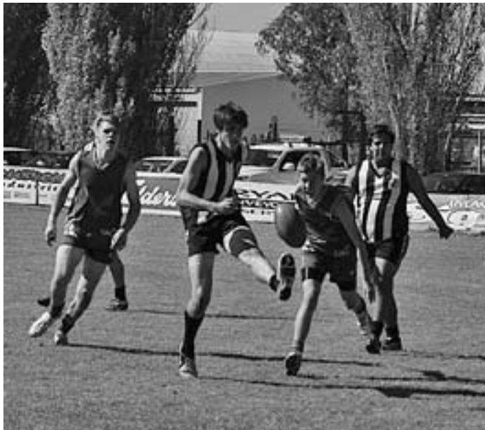
Kalangadoo vs Hatherleigh Senior Colts.