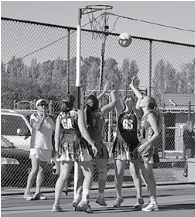
Kalangadoo v Hatherleigh.