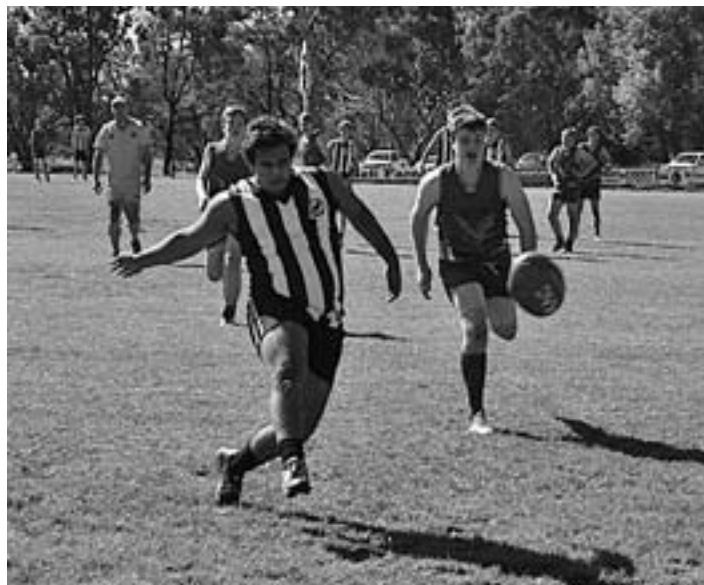
Kalangadoo vs Hatherleigh Senior Colts.