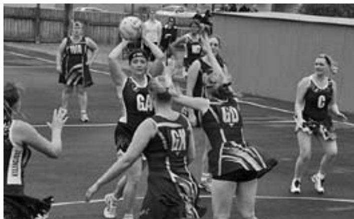
KALANGADOO GA looking for a better option to goal during their round two clash against Kongorong.