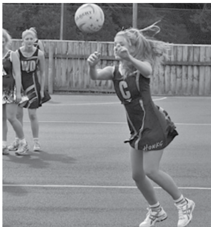
KONGORONG centre passes the ball into the goal circle during their round two contest against Kalangadoo.