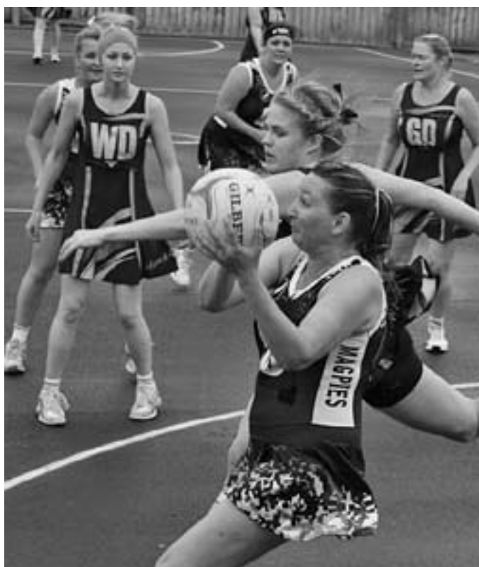
ONLY JUST: Netball action from the Kongorong versus Kalangadoo round two match.