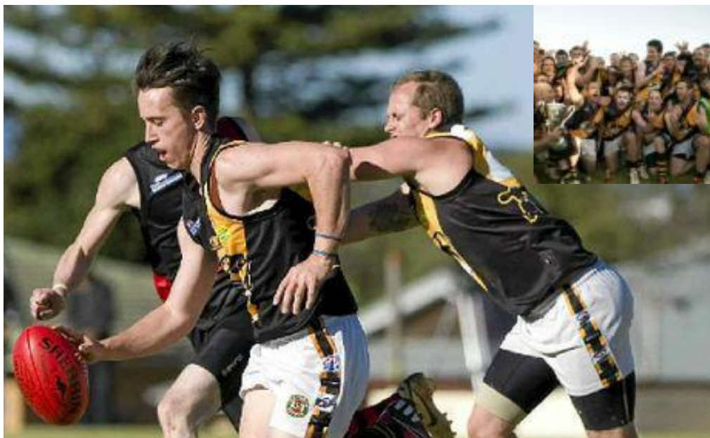
Action from last years GF - Inset Tigers claim 3-peat