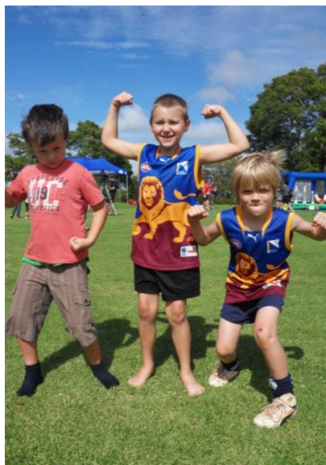
Lions Community Camp - Young Lions Fans'Roar