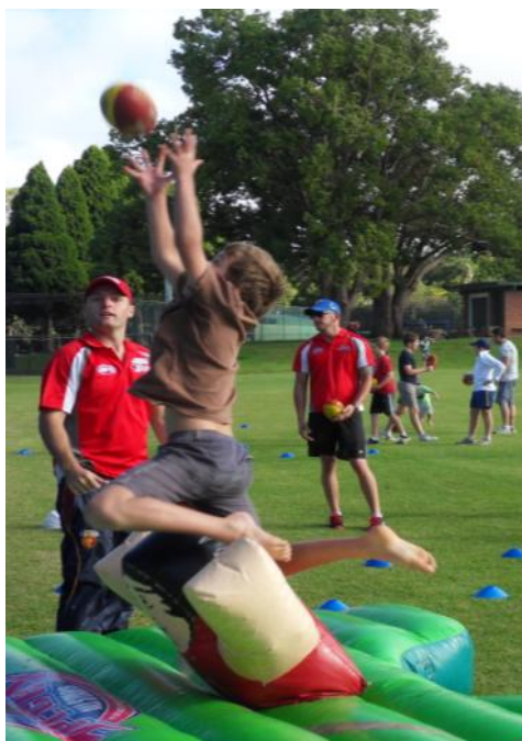
Lions Community Camp - Speccy