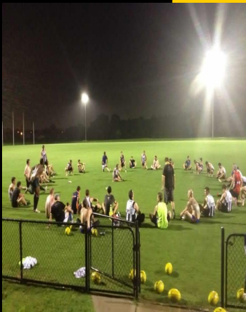
The boys warm down after a big night on the track

After hours on the training track, senior coach Mark Coles believes the division 2 Magpies are ready to aim up for a full on tilt at a title in 2013.