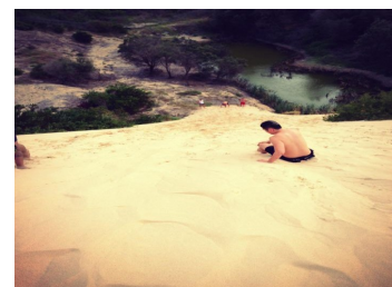
Saturdays at Wanda, where the premierships assault begins for those keen enough