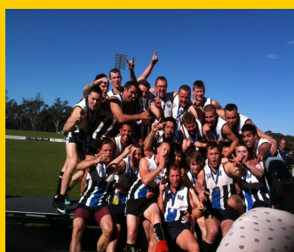
Moorebanks 2010 Premiership winning team,

will be held at Kelso Oval on Sunday 17th and will be against division one side Parramatta Holroyd.