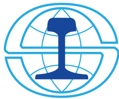
SPENO RAIL MAINTENANCE