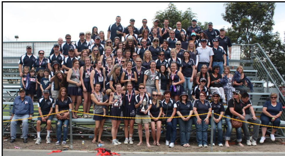
"Some" of our proud supporters following the B Grade and A Grade victories – NGFNL Grandfinal 2011