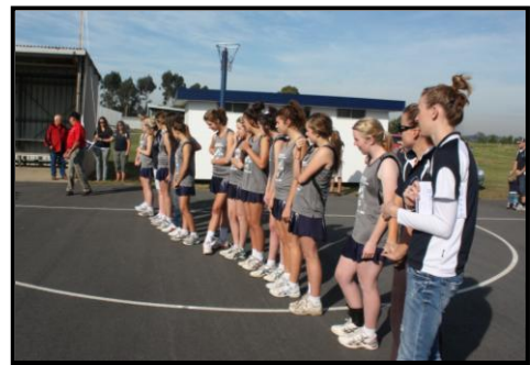
Unfurling the 17U 2010 Premiership Flag Rnd. 2 - 9 th April 2011