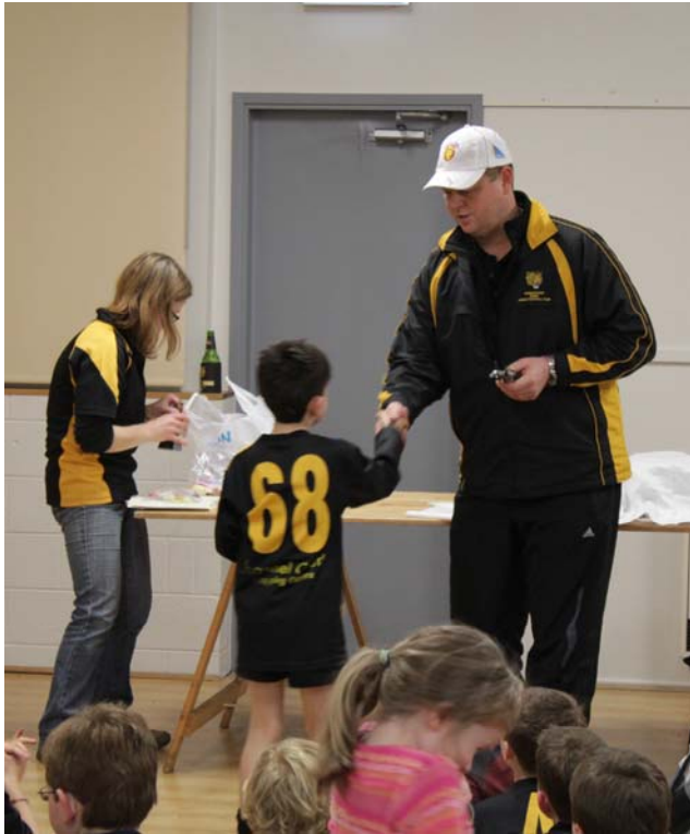
Under 8 boys were so excited to receive their trophies at their presentation night