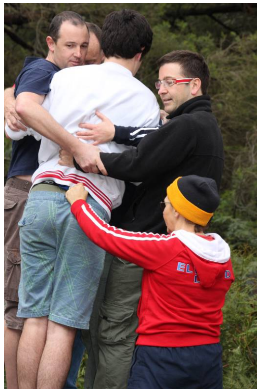
Team Building activities at the Grampians Camp