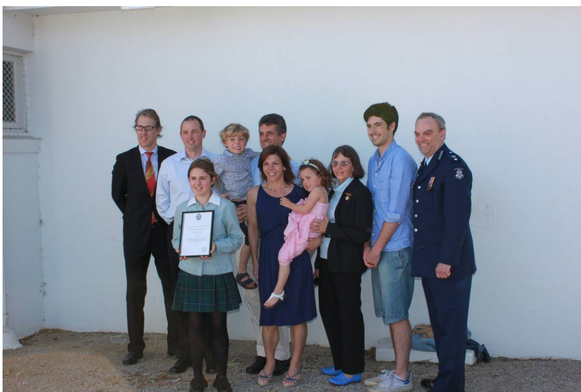
Police Commendation awarded to Elwood Life Saving Club for assistance in finding a missing child