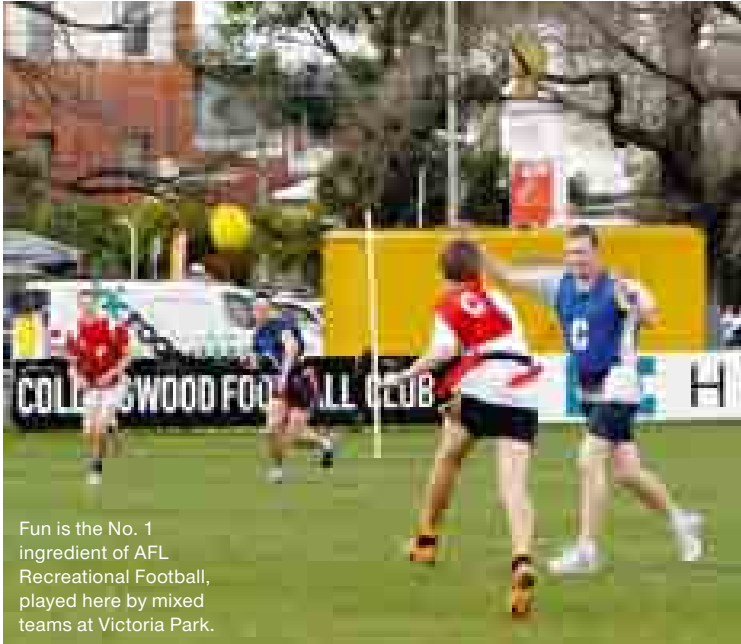
Fun is the No. 1 ingredient of AFL Recreational Football, played here by mixed teams at Victoria Park.

AFL Recreation Football has been developed to provide an opportunity for all Australian Football enthusiasts to enjoy participating in a game that has strong parallels with the traditional game.