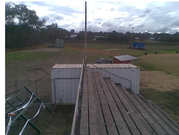
Construction begins at Roddies Oval