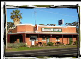
THE TOOLLEEN HOTEL Phone : 03 5433 6220

176 Murphy Street Bendigo Phone : 03 5441 7786