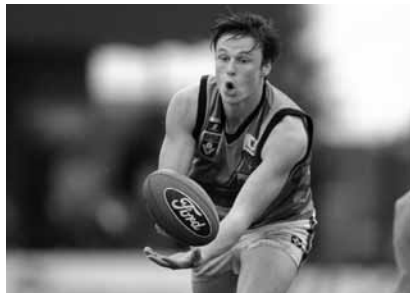
Round 15 VFL action from Coburg vs Bendigo Bombers.