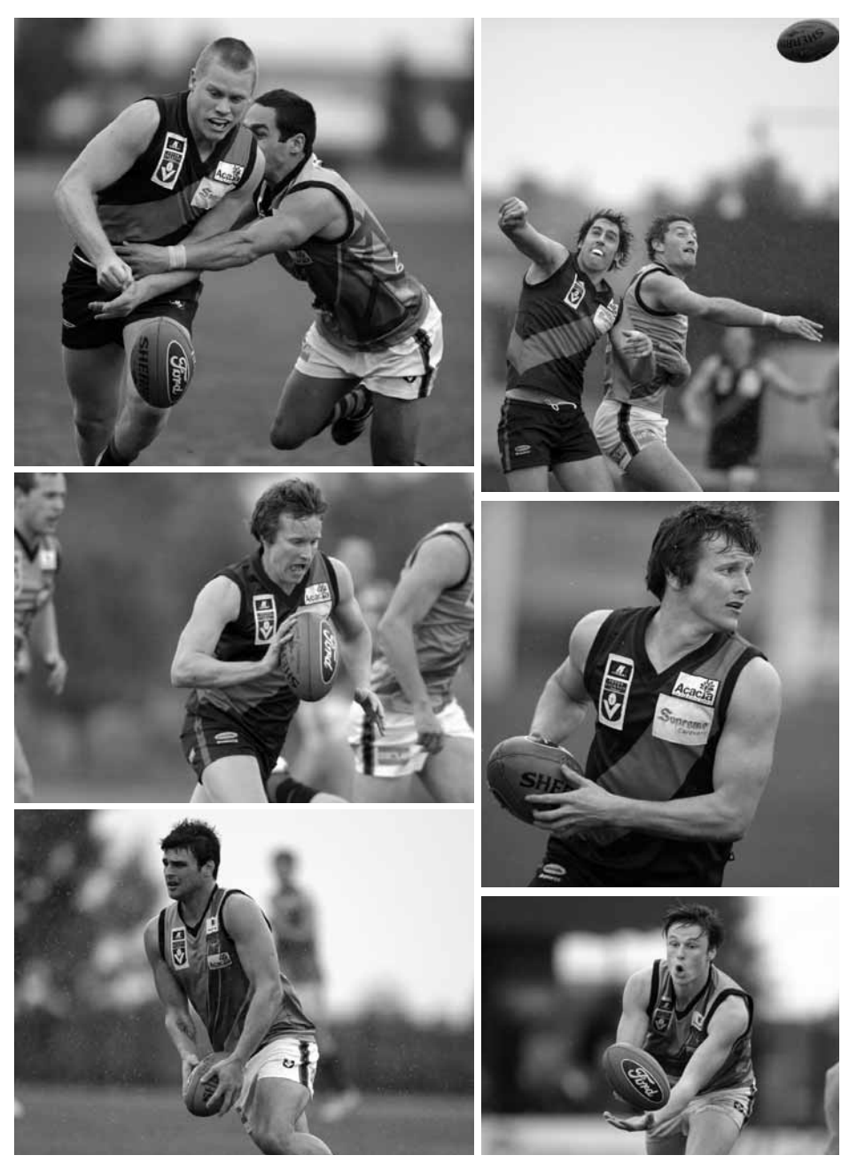
Round 15 VFL action from Coburg vs Bendigo Bombers.