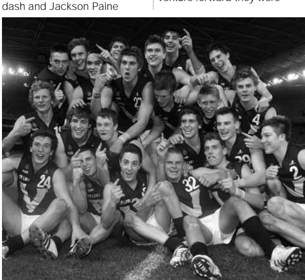
The victorious Vic Metro side.