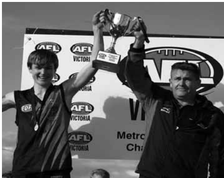
Under 14 – Div 1