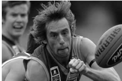
Action from Northern Bullants vs Williamstown, round 14.