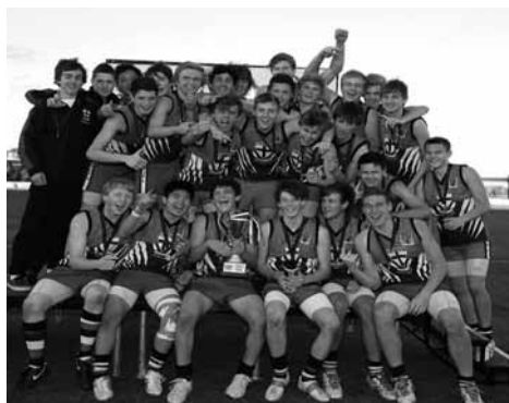
Under 15 – Div 1