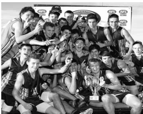
Under 15 – Div 2